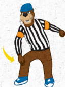
KNEEING Using the knee to impede an opponent