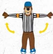
WASHOUT Disallowing of a goal when signaled by a referee. No off-side or icing when used by a linesman