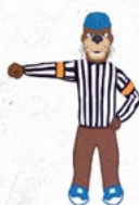
ROUGHING Engaging in fisticuffs or shoving