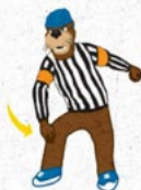
KNEEING Using the knee to impede an opponent