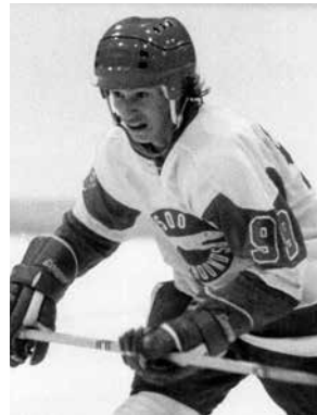
WAYNE GRETZKY TROPHY WESTERN CONFERENCE CHAMPIONS