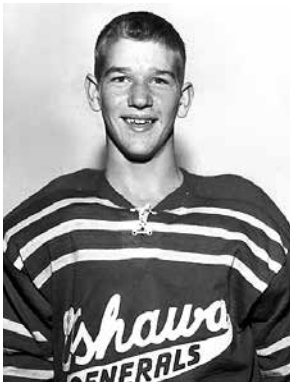
BOBBY ORR TROPHY EASTERN CONFERENCE CHAMPIONS

Both honourees are members of the Hockey Hall of Fame.