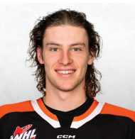
DOB: 06/23/2005 CALGARY, ALTA.