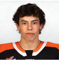
DOB: 02/21/2008 OSOYOOS, B.C.