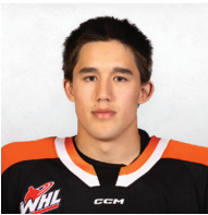
DOB: 11/19/2006 Winnipeg, Man. 5-9, 165 LBS. SHOOTS: RIGHT WHL DRAFT: WPG 1-18 (2021) NHL DRAFT: #156-NA SKATER