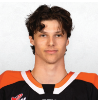
DOB: 06/13/2005 EDMONTON, ALTA.