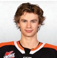
DOB: 12/20/2007 WHITEHORSE, YT. 6-0, 165 LBS. SHOOTS: LEFT WHL DRAFT: MH 1-1 (2022) NHL DRAFT: ELIGIBLE 2026