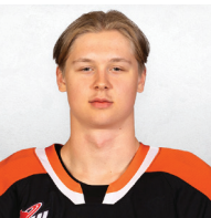
DOB: 02/15/2006 HAMINA, FINLAND. 6-1, 190 LBS. SHOOTS: LEFT CHL IMPORT DRAFT: MH 2-107 (2024) NHL DRAFT: UTA 3-96 2024