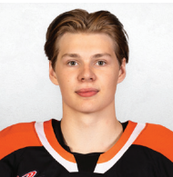
DOB: 08/03/2006 KELOWNA, B.C.