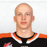
DOB: 02/28/2006 KUOPIA, FINLAND. 6-5, 215 LBS. SHOOTS: LEFT CHL IMPORT DRAFT: MH 1-47 (2024) NHL DRAFT: DAL 5-158 (2024)