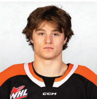
DOB: 04/02/2006 CHAUVIN, ALTA. 6-0, 190 LBS. SHOOTS: RIGHT WHL DRAFT: SEA 2-38 (2021) NHL DRAFT: #100-NA SKATER