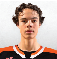
DOB: 01/11/2006 LETHBRIDGE, ALTA.