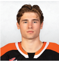
DOB: 07/26/2005 MEDICINE HAT, ALTA. 6-3, 205 LBS. WHL DRAFT: MH 2-39 (2020) NHL DRAFT: ELIGIBLE 2025