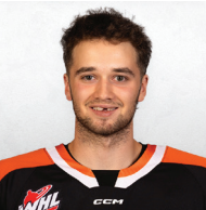
DOB: 04/06/2025 EDMONTON, ALTA. 5-11, 175 LBS. SHOOTS: RIGHT WHL DRAFT: KEL 3-49 (2020) NHL DRAFT: ELIGIBLE 2025