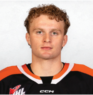
DOB: 11/08/2005 CALGARY, ALTA. 6-0, 187 LBS. SHOOTS: LEFT WHL DRAFT: MH 5-105 (2020) NHL DRAFT: CGY 2-40 (2020)