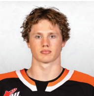
DOB: 11/26/2008 SALT LAKE CITY, UT.